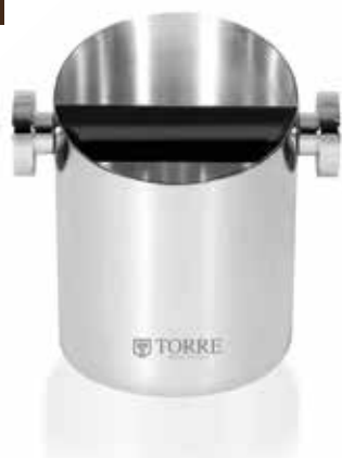
➤ Battifondi domestic