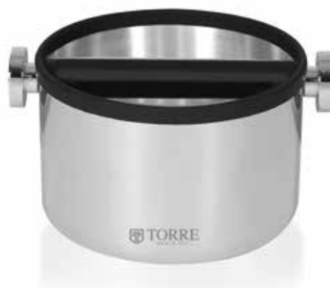
➤ Battifondi Pro