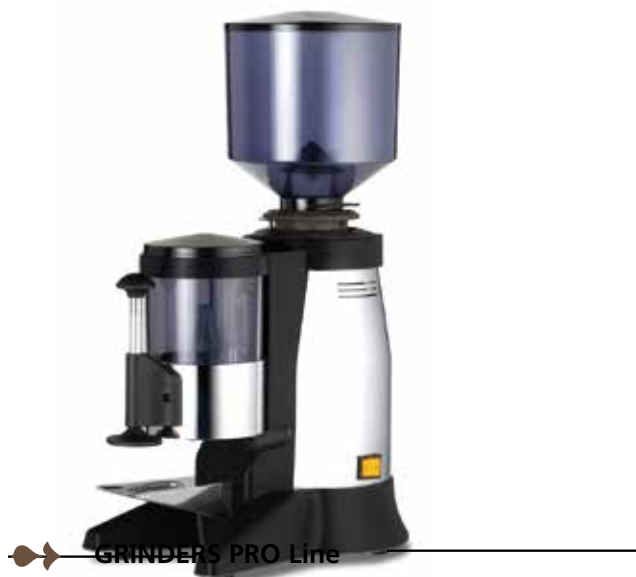
GRINDERS PRO Line