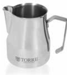
➤ Milk jug