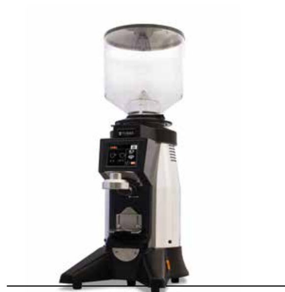
GRINDERS PRO Line